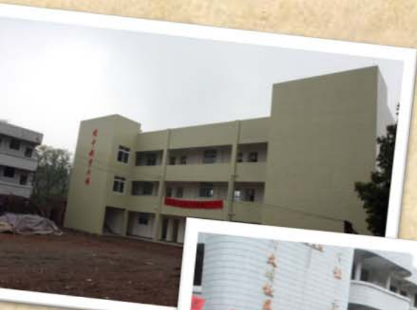
“Seeds of Hope” Project Anyue, Sichuan

After two years of effort, we have collected proceeds amounting to HK$1.5 million. Finally, we have rebuilt a primary school, Minzhu Primary School, at Anyue, Sichuan with the help of World Vision. In the spring of 2010, a teaching block of the school, built with fund raised by Yew Chung, was completed for use. In March of that year, representatives of Yew Chung visited the school.