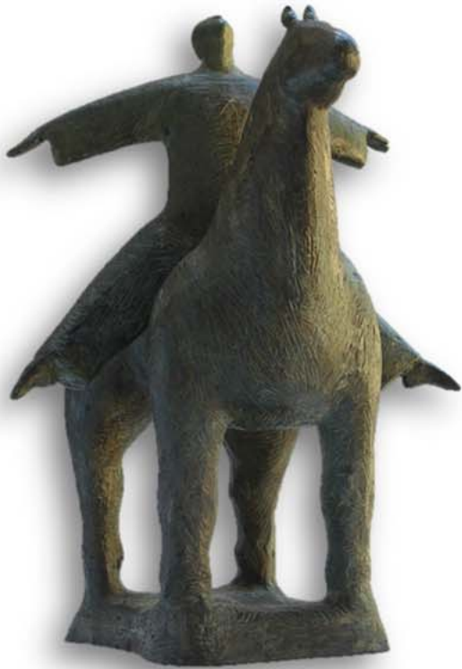
Joy Museum of Art, Hamilton Regional Gallery.