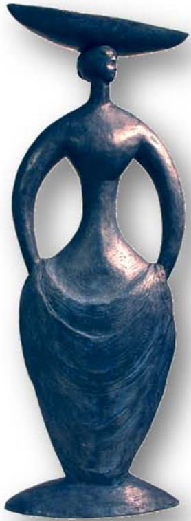
Women by the Sea