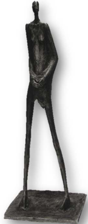
Girl on the Hem