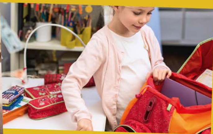
(互聯網圖片 Internet photo)