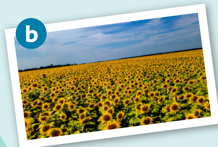
a. 康乃馨 Carnations b. 向日葵 Sunflowers