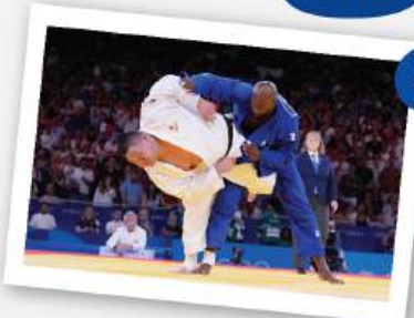
a. 柔道 Judo b. 跆拳道 Taekwondo