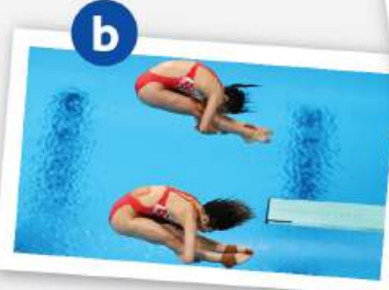
a. 劍擊 Fencing b. 跳水 Diving