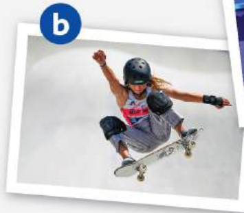
a. 霹靂舞 Break Dancing b. 滑板 Skateboarding